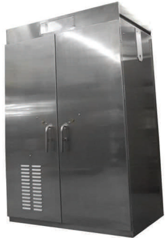
Eagle 350 ATC Cabinet

One of the primary design objectives with the ATC cabinet was safety, for both drivers and maintenance personnel. To that end, the cabinet has been designed to safeguard users from accidental shock hazard for components greater than 48V by utilizing touch safe components and guarding high voltage connections. Along with the standard voltage monitoring, the 352 ATC cabinet also includes current monitoring to improve driver safety in the event of a conflict situation. A key new feature is the ability to remove and replace the output assembly without turning the intersection dark.